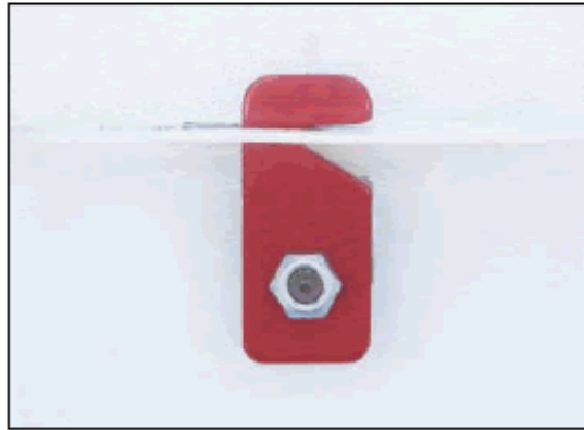
Hook Lock engaged on door

LEVEL ONE has a HOOK shaped cam (latch) that is made of 3/16" thick stainless steel. The hook design actually "grasps" the box frame, locking itself securely into place.