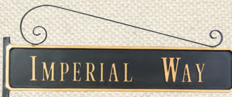
Hanging Frame with Scroll Arm