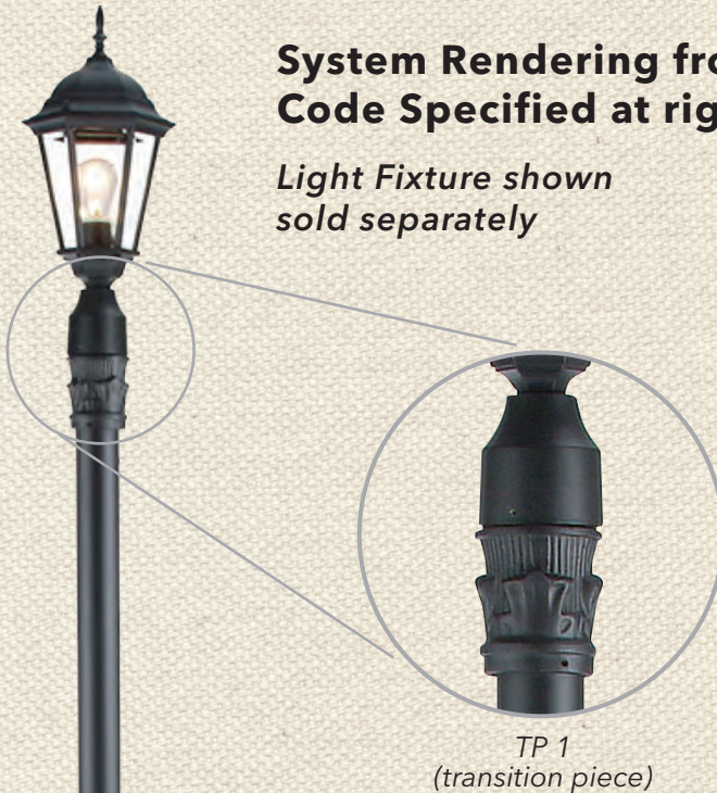
TP 1 (transition piece)

Pole LP (standard height is 6.5 feet above ground)