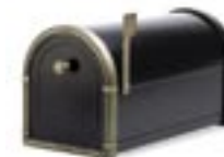
BLACK BODY WITH ANTIQUE BRONZE ACCENTS