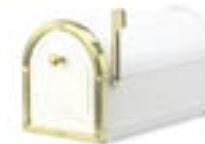
WHITE BODY WITH POLISHED BRASS ACCENTS