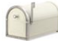
SAND BODY WITH ANTIQUE NICKEL ACCENTS

Beautifully constructed and classically styled our premium post mount mailboxes offer dozens of color and accent combinations as well as custom address lettering and post mounting options. These striking mailboxes add instant curb appeal to any home pleasing even the most discerning homeowner.