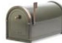
BRONZE BODY WITH ANTIQUE COPPER ACCENTS