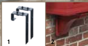
1 Optional deck rail brackets