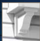
1 Available with, or without decorative supports