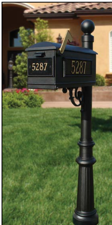
LMC-804 Cast Aluminum Mailbox: Shown in black with Fluted Base and Ball Finial.