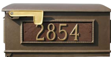
Bronze mailbox with dark brown (gold numbers) side plate