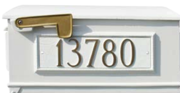
White mailbox with white (gold numbers) side plate