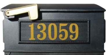
Economy vinyl address numbers available in gold, white or black