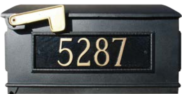
Black mailbox with black (gold numbers) side plate