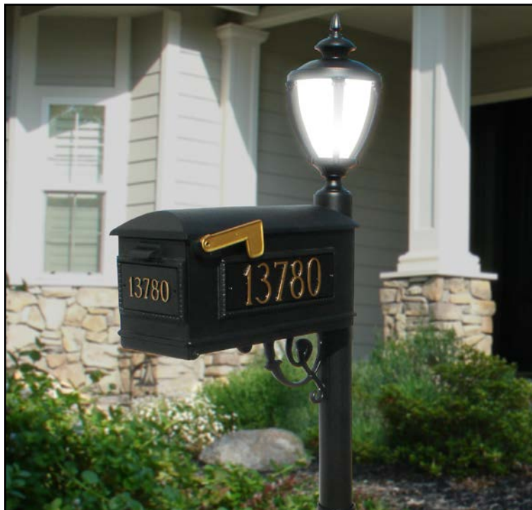
HF-17220 Hamptonville Outdoor Post Light: black or white finish, cast aluminum cage and finial, glass globes, brass and stainless steel components, hard-wired 110/120 volt, 8" x 17".