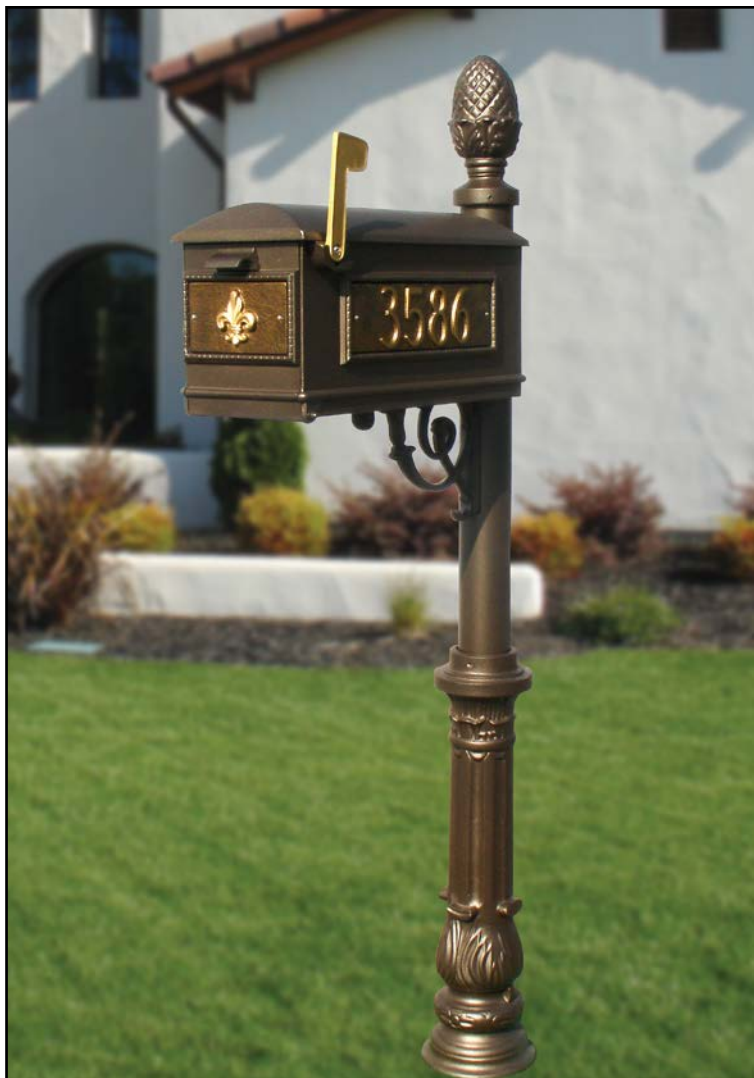
LMC-703 Cast Aluminum Mailbox: Shown in bronze with Ornate Base and Pineapple Finial. Mailbox 8-1/2" x 10" x 20" (optional address plates). 3" OD direct burial pole height 5' 2".