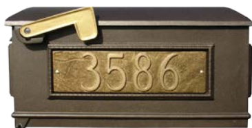
Bronze mailbox with antique bronze (gold numbers) side plate

Our cast aluminum address plates are available in a wide range of color combinations. Please see our website for additional choices.