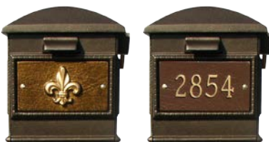
Choose a cast aluminum front plate with fleur-de-lis or address