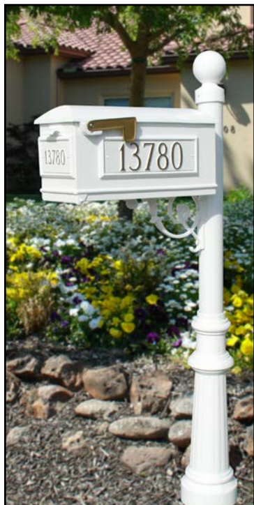
LMC-804 Cast Aluminum Mailbox: Shown in white with Fluted Base and Ball Finial.

Our Lewiston Collection is made from rust-free cast aluminum with a durable powder coat finish. Mix-and-match bases and finials to create a unique combination. For a finishing touch, add elegant cast aluminum address plates to the sides and front of the mailboxes. Builders and HOAs can personalize their address plates with a custom logo. Send us a sample of the logo for a free quote.