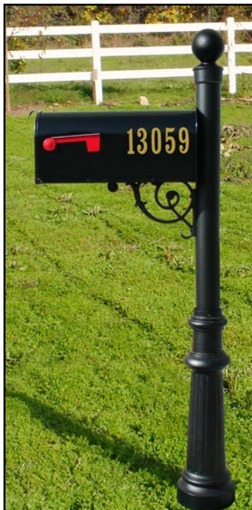
LPST-804-E1 Economy Mailbox: Shown in black with Fluted Base and Ball Finial.