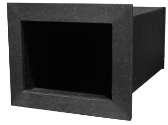
Special order from your retailer today!

QualArc, Inc. 11300 Trade Center Dr., Ste. A Rancho Cordova, CA 95742 916-273-1576 Fax 916-635-0228 www.qualarc.com