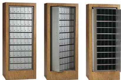
Inner cabinet rotates 180 degrees for mail distribution