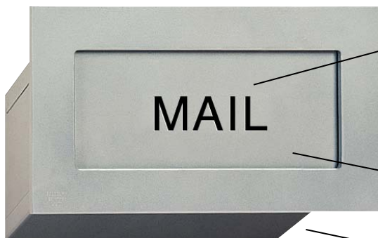
#2255 with optional custom engraving - black filled (#2266) displayed

Constructed of 1/4" thick aluminum plate and 20 gauge steel, Salsbury recessed mounted mail drops feature a spring-loaded mail flap and an adjustable mail flap stop. Mail drops also feature a durable powder coated finish available in five (5) contemporary colors. Custom engraving (#2266) is available as an option upon request. An optional receptacle (#2256 - see page 49 - order separately) aligns with the mail drop chute for receipt of deliveries. Mail drops are ideal for collecting documents and small packages and may be used for U.S.P.S. residential door mail delivery.