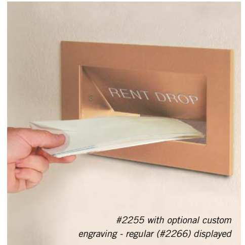
#2255 with optional custom engraving - regular (#2266) displayed