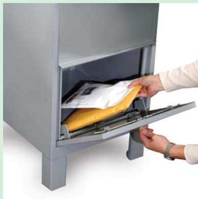
Secure collection of items