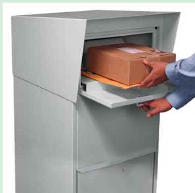
Convenient depositing of items