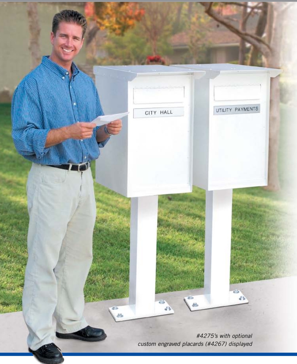
#4275's with optional custom engraved placards (#4267) displayed