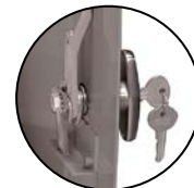
Replacement T-handle lock (with (2) keys) (#4290 - $40.00)