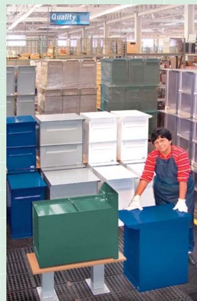
Final inspection of pedestal drop boxes

#4275 units with custom options (#4280) displayed