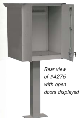
Rear view of #4276 with open doors displayed

Made entirely of aluminum, Salsbury 4200 series pedestal drop boxes are available in three (3) different sizes. Model #4275 is 15-3/4" wide, model #4276 is 23" wide and model #4277 is 30-1/4" wide. All pedestal drop boxes include a 28-1/2" high matching pedestal and are the same height (55-1/2") and depth (19"). Standard units are accessed from the rear through a two (2) point latching master door on the #4275 and two (2) master doors on the #4276 and #4277. Each door swings open over 90 degrees for unloading convenience. Standard units include a locking "T" handle (#4290) on the rear door(s), a weather protection hood and a mail flap on the front of the unit. The pedestal drop boxes feature a durable powder coated finish available in three (3) contemporary colors (or primer). Custom options (#4280 - see page 55) and custom colors (#4205) are available upon request.