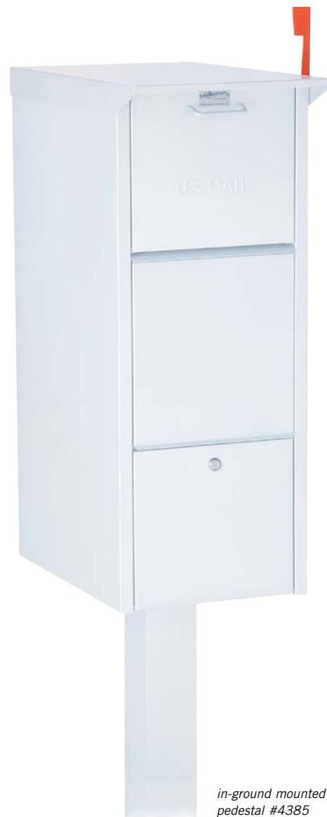
in-ground mounted pedestal #4385