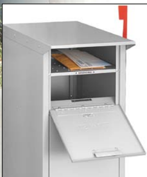
Front view of #4375 displayed