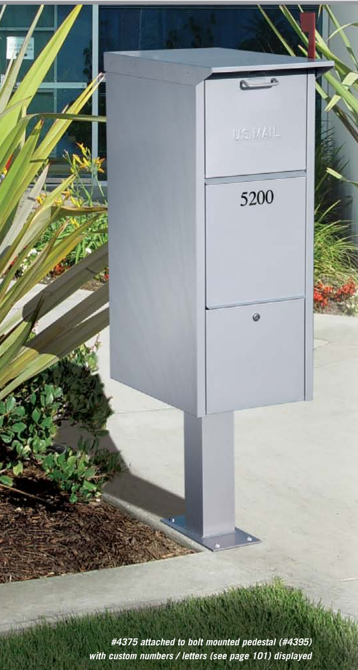
#4375 attached to bolt mounted pedestal (#4395) with custom numbers / letters (see page 101) displayed