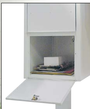
Rear view of #4375 displayed