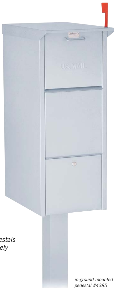
in-ground mounted pedestal #4385