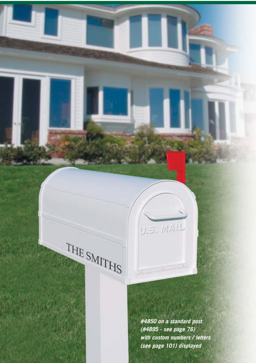
#4850 on a standard post (#4895 - see page 76) with custom numbers / letters (see page 101) displayed