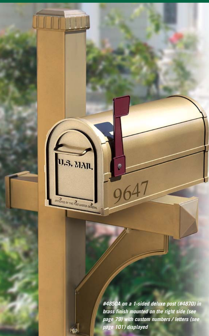
#4850A on a 1-sided deluxe post (#4870) in brass finish mounted on the right side (see page 79) with custom numbers / letters (see page 101) displayed