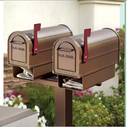
(2) #4850A's and (2) #4815A's on a two (2) wide spreader (#4882) mounted on a standard post (#4865 - see page 76) in bronze finish displayed