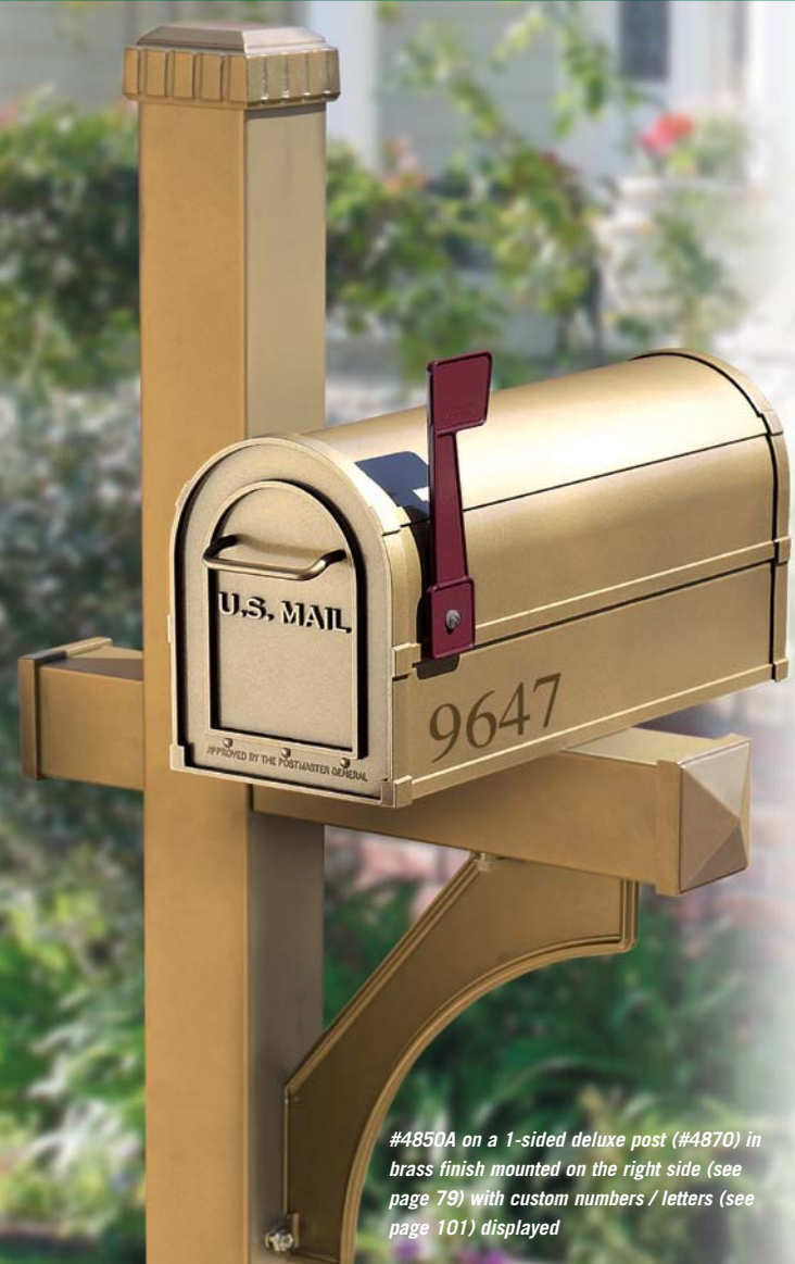
#4850A on a 1-sided deluxe post (#4870) in brass finish mounted on the right side (see page 79) with custom numbers / letters (see page 101) displayed