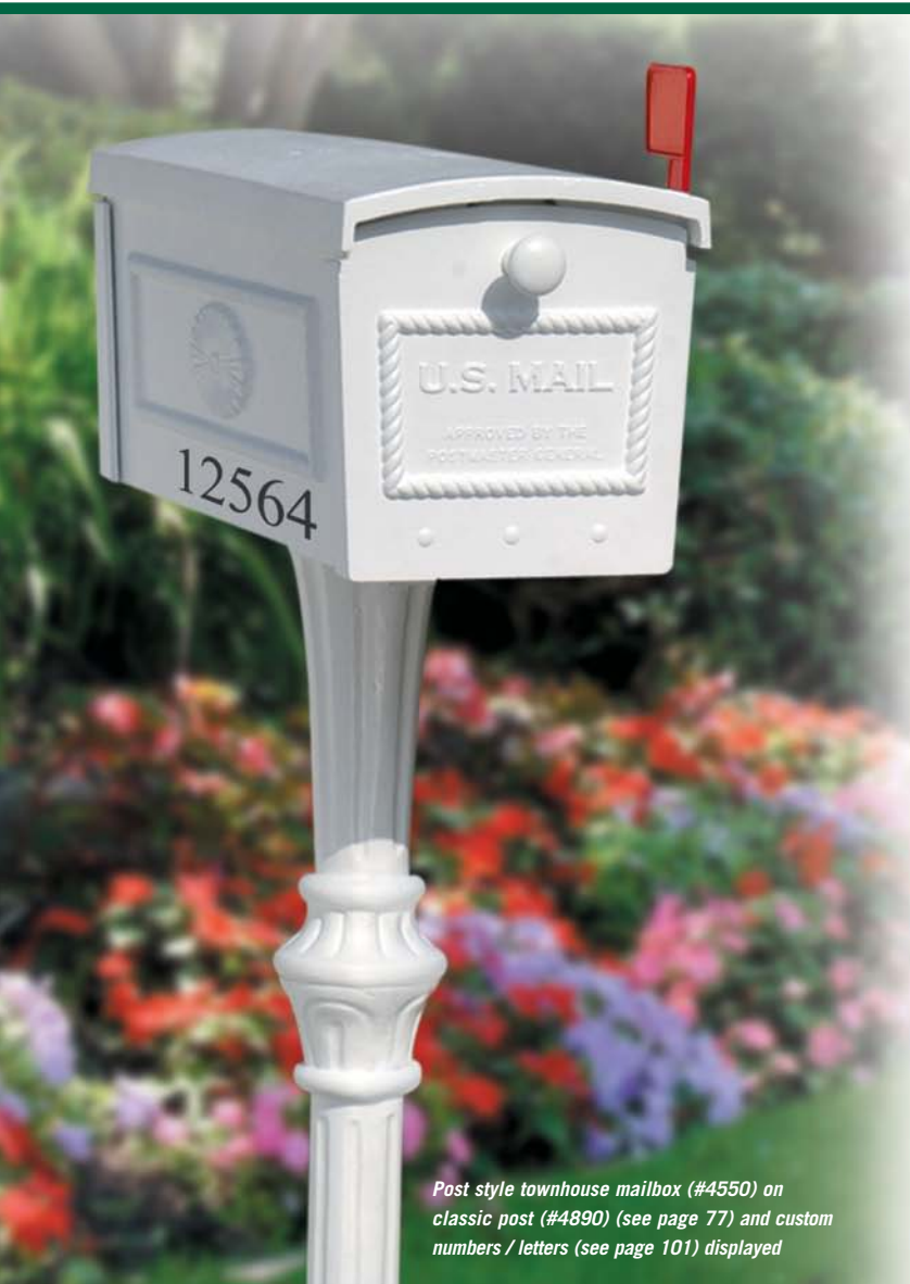
Post style townhouse mailbox (#4550) on classic post (#4890) (see page 77) and custom numbers / letters (see page 101) displayed