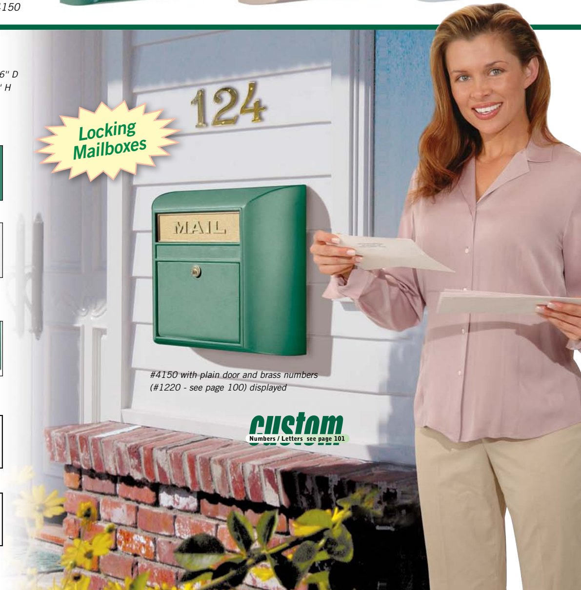
#4150 with plain door and brass numbers (#1220 - see page 100) displayed