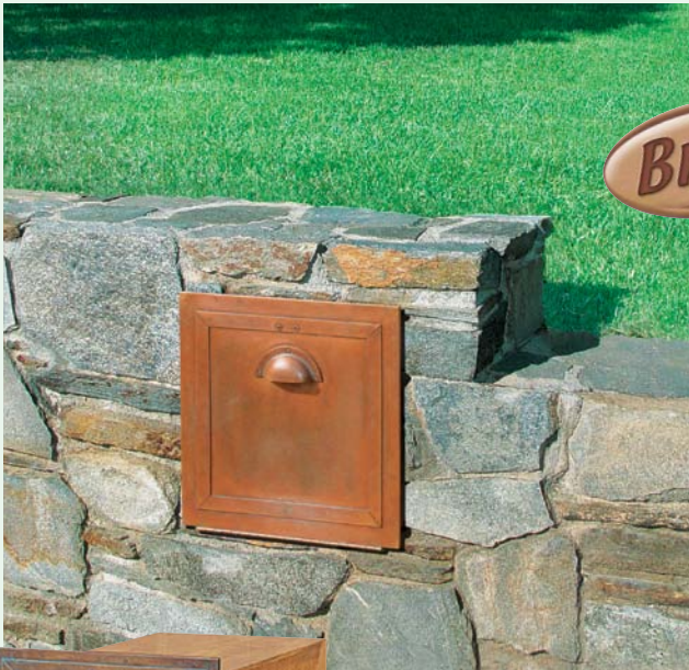
#4440 in a wall displayed

Made of solid brass, Salsbury recessed mounted antique brass column mailboxes are handcrafted and provide a custom look. Antique brass column mailboxes include a 9-1/2" W x 9-1/2" H door that is accessed from the front and are designed to be recessed mounted in columns, masonry or walls. Antique brass column mailboxes may be used for U.S.P.S. residential door mail delivery.