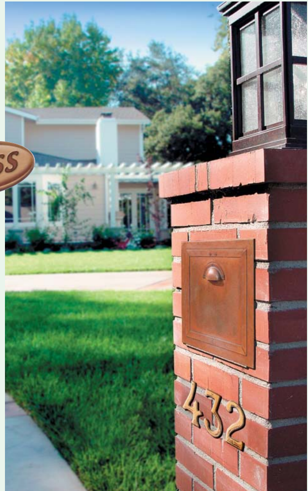
#4440 in a column with brass numbers (#1220) (see page 100) displayed