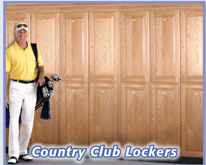
Country Club Lockers